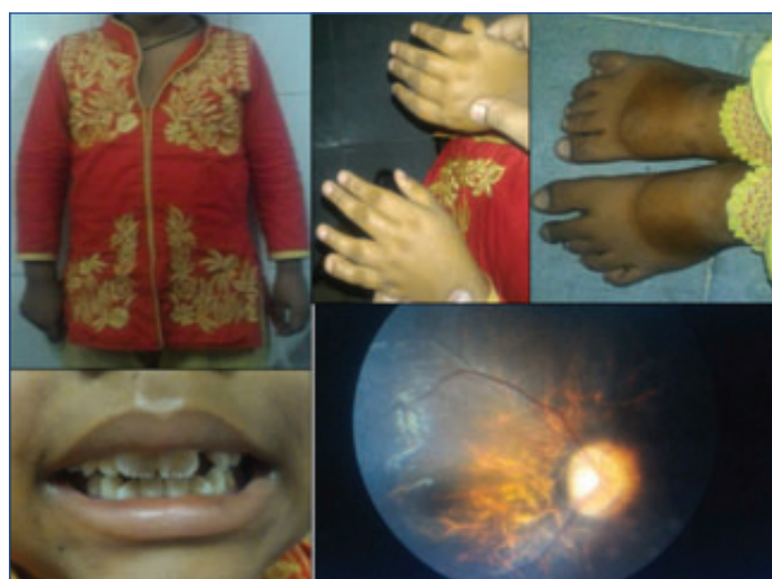
[Table/Fig-1]: Case no.1 showing (clockwise from top left) central obesity, polydactyly and brachydactyly involving hand and feet, fundus finding, and dental malocclusion.

An eight-year-old girl presented with the chief complaint of diminution of vision in both eyes at night since one year (as told by father). Diminution of night vision was progressive in nature. She had history of operation in her feet due to some congenital deformity. Although enrolled in school, her IQ was much lower than others of the same age group. She had diminished hearing. Her visual acuity at presentation was 6/12 in both eyes on Snellen's chart. There was no familial history of similar symptoms and her parents were not consanguineous. Systemic examination revealed truncal obesity to be present, with polydactyly and brachydactyly involving both hands and feet. Dental malocclusion was also present [Table/Fig-1]. On ocular slit lamp examination, anterior segment was normal. Fundus examination by indirect ophthalmoscope revealed bilateral diffuse retinal dystrophy, arteriolar attenuation, disc pallor and absence of any pigments [Table/Fig-1]. Electroretinogram showed depressed rod function. Bilateral tympanic membrane was intact on otoscopic examination. Tuning fork test pointed towards bilateral sensori-neural hearing loss which was confirmed by Brainstem Evoked Response