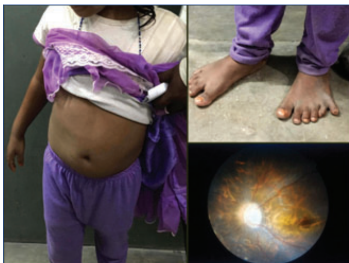
[Table/Fig-3]: Case no. 2 showing (clockwise from left) central obesity, polydactyly and brachydactyly involving feet, and fundus finding.

dystrophy without pigmentation. Otoloscopic examination showed serosanguinous discharge which on mopping revealed Grade 3 retraction of pars tensa in both ears with bubbles behind tympanic membrane in left ear. Audiometry showed mild conductive hearing loss. On per-oral examination, both tonsils were enlarged (Grade 3). Her social quotient was very low. Hypogonadism was again not evident on USG of abdomen. A course of 15000 IU of vitamin A was given for a month along with antihistaminics for serous otitis media. Tympanotomy with placement of Grommet and adenotonsillectomy were advised to the patient's parents, but they refused any further surgical procedures. The patient was referred to the Department of Nephrology and Cardiology for further assessment but was lost to follow up.